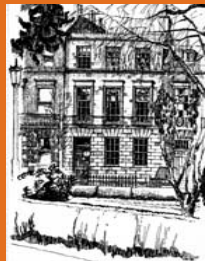
17 Heriot Row

Discover Stevenson's Edinburgh in full at www.cityofliterature.com and www.ewht.org.uk