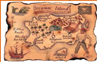
Treasure Island map by kind permission of UKOLN, developers of the Treasure Island website