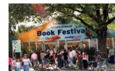
The Edinburgh International Book Festival