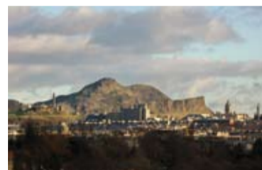
Arthur's Seat and Salisbury Crags

The setting of the Site is an ancient volcanic terrain of hills, valleys and skylines.