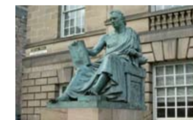
Statue of philosopher David Hume

The city is home to residential and professional communities who have helped to create its unique character.