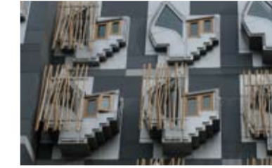
The Scottish Parliament

• Edinburgh is a capital city with national institutions, a continuing tradition of law and medicine, and with internationally recognised festivals and events.