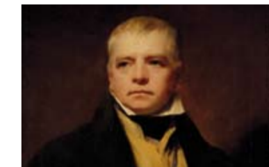
Sir Walter Scott

Edinburgh is a royal and ceremonial capital city with national institutions.