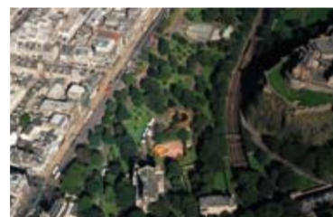
Aerial view of Prince Street Gardens

A green space of continuous drama and tranquillity within walking distance of the city centre.