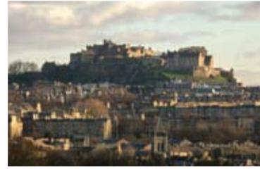
Edinburgh Castle dominates the skyline

• The volcanic hills and valleys create an internationally recognised skyline and stunning views.