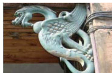
Dragons at the entrance to Wardrop's Close

• The quality of the architecture and the striking contrast of streetscape, between the Medieval Old Town and Georgian New Town.