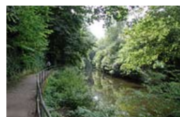
Leafy footpath along the Water of Leith

The green valley of Princes Street Gardens separates the Old and New Towns.