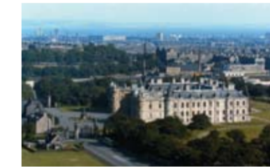
The Palace of Holyrood House